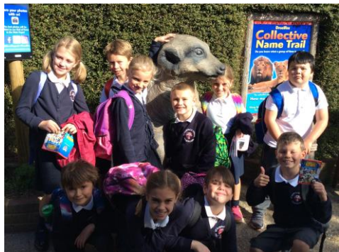
Drusillas Zoo Park 1 st October 2018