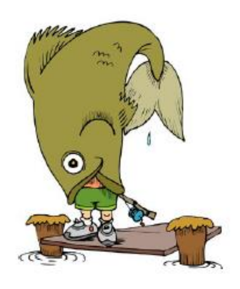
A big fish is on the hook.