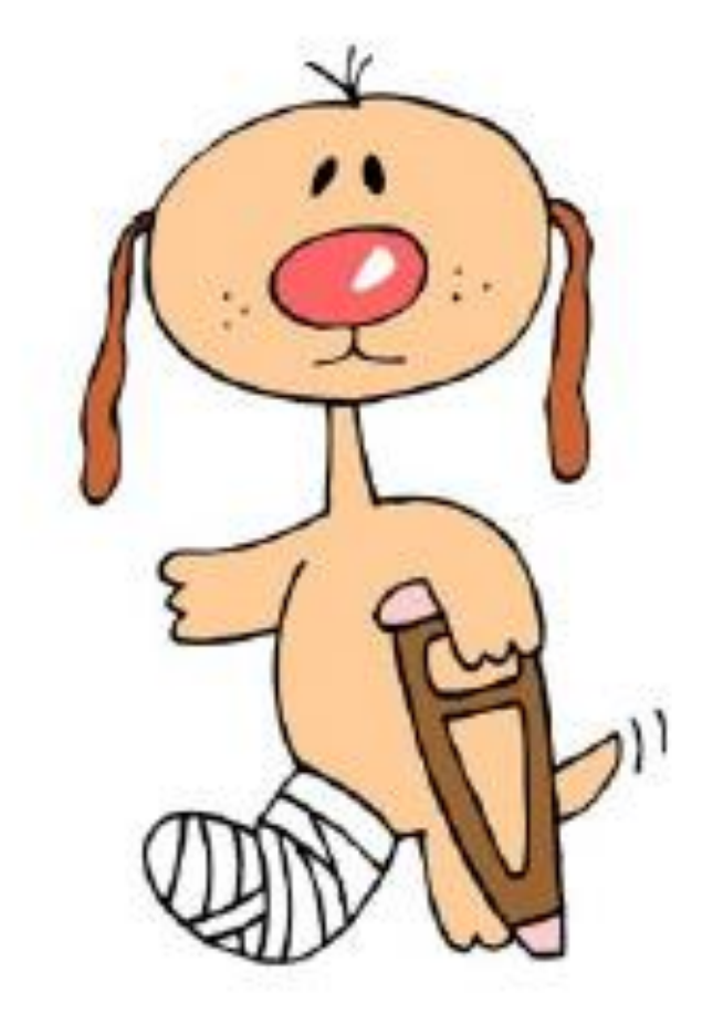
The dog's foot is hurt.