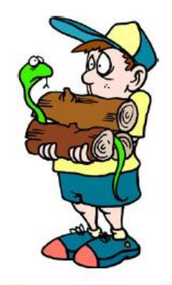
I see a snake in the wood!