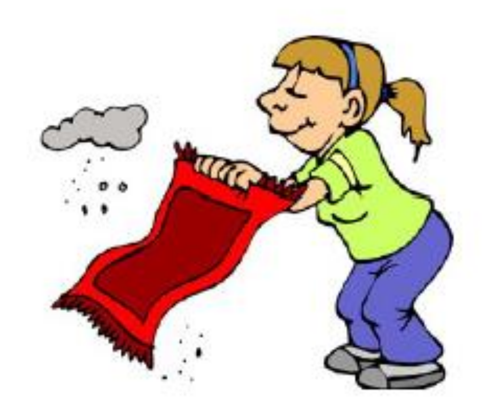
She shook the red rug.