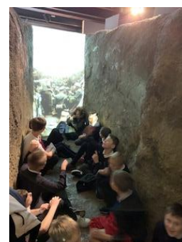
The ‘Trench Experience’