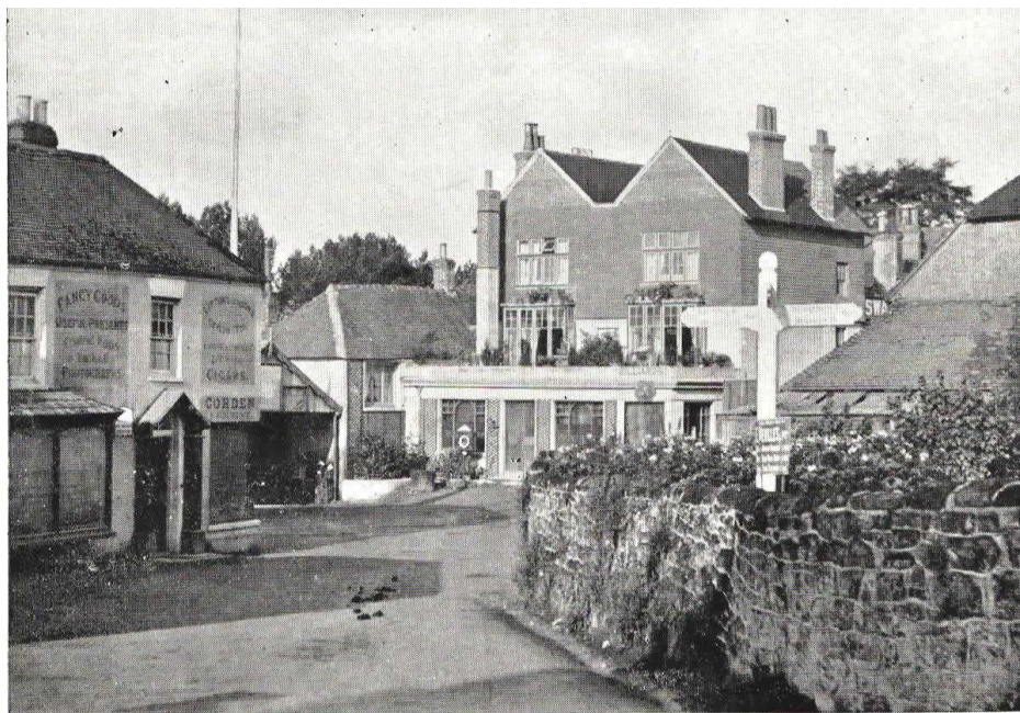
"SWAN HOTEL, PULBOROUGH."