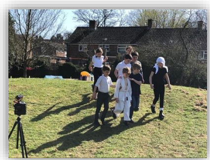
Easter Eucharist -