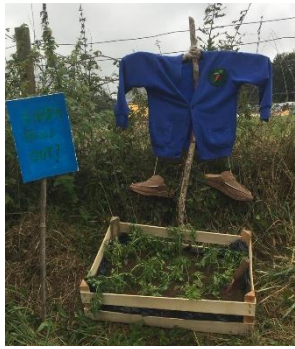
More pictures from the scarecrow competition at the Harvest Fayre