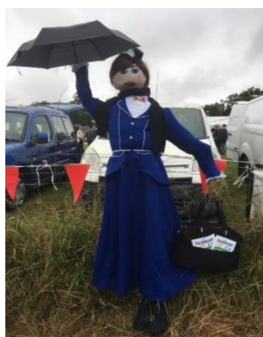
2 nd Place Mary Poppins Little Explorers