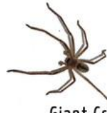
Giant Crab Spider