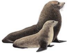
Galápagos Fur Seal