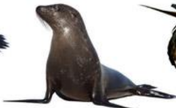
Galápagos Sea Lion