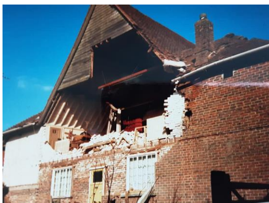
The Old Village Hall