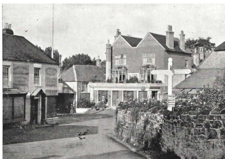
"SWAN HOTEL, PULBOROUGH."