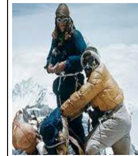
Photograph of Hillary and Norgay, taken on the peak of Mount Everest, 8,848 metres above sea level!