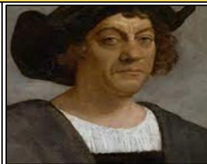
Portrait of Columbus from 1519, completed after his death.