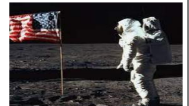
Photograph of Armstrong with an American flag on the lunar surface.