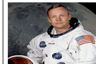
NASA photograph of Armstrong taken in 1969.