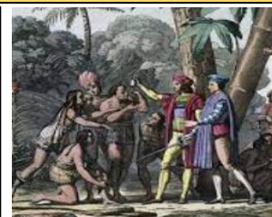
Modern image showing Columbus' treatment of indigenous people.