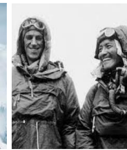
Photograph of both climbers taken upon their return to base camp, after safely descending the mountain.