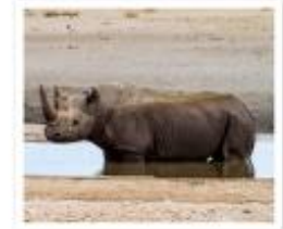
Western black rhino