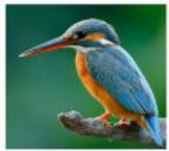
Kingfishers are birds.