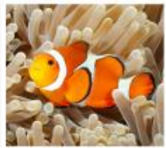
Clownfish are fish.