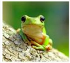
Frogs are amphibians.