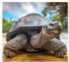
Tortoises are reptiles.