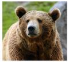
Brown bears are mammals.

Animals can be sorted into six different groups. These are mammals, amphibians, birds, fish, reptiles and invertebrates.