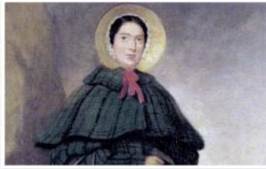
Portrait of Mary Anning

Mary Anning was a British palaeontologist, who was born in 1799. She made many important fossil discoveries.