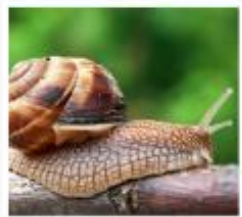
Snails are invertebrates.