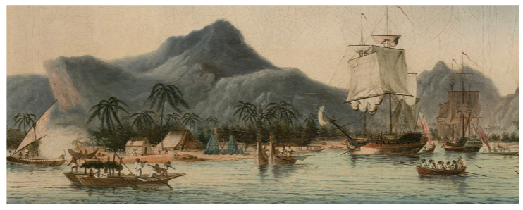
Resolution and Discovery in the Pacific Ocean

In 1776, Captain Cook went on his final voyage. He sailed on the Resolution again and the Discovery travelled with him. He was looking for a route between the Atlantic and Pacific Oceans. He visited the Hawaiian Islands, where he was killed.